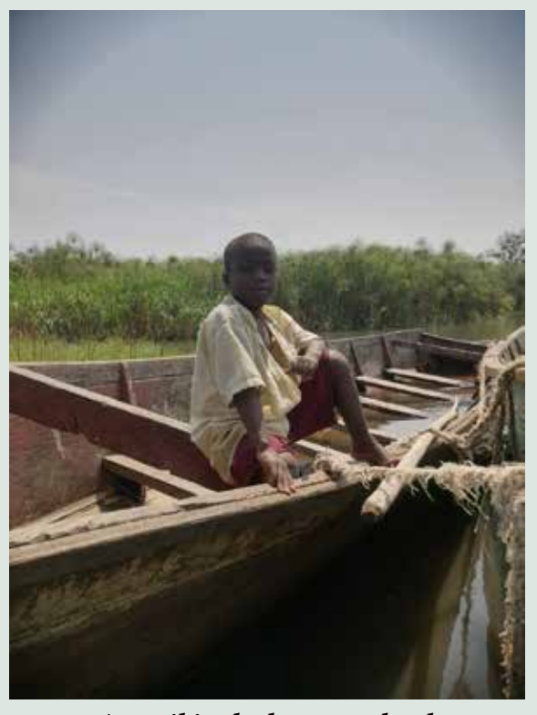
A pupil in the boat to school

travel for over 10km via boats to access education. Subsequently, their lives are endangered as they surf through the wild animals infested waters and the raucous sea waves that mercilessly hit their boats during peak hours.