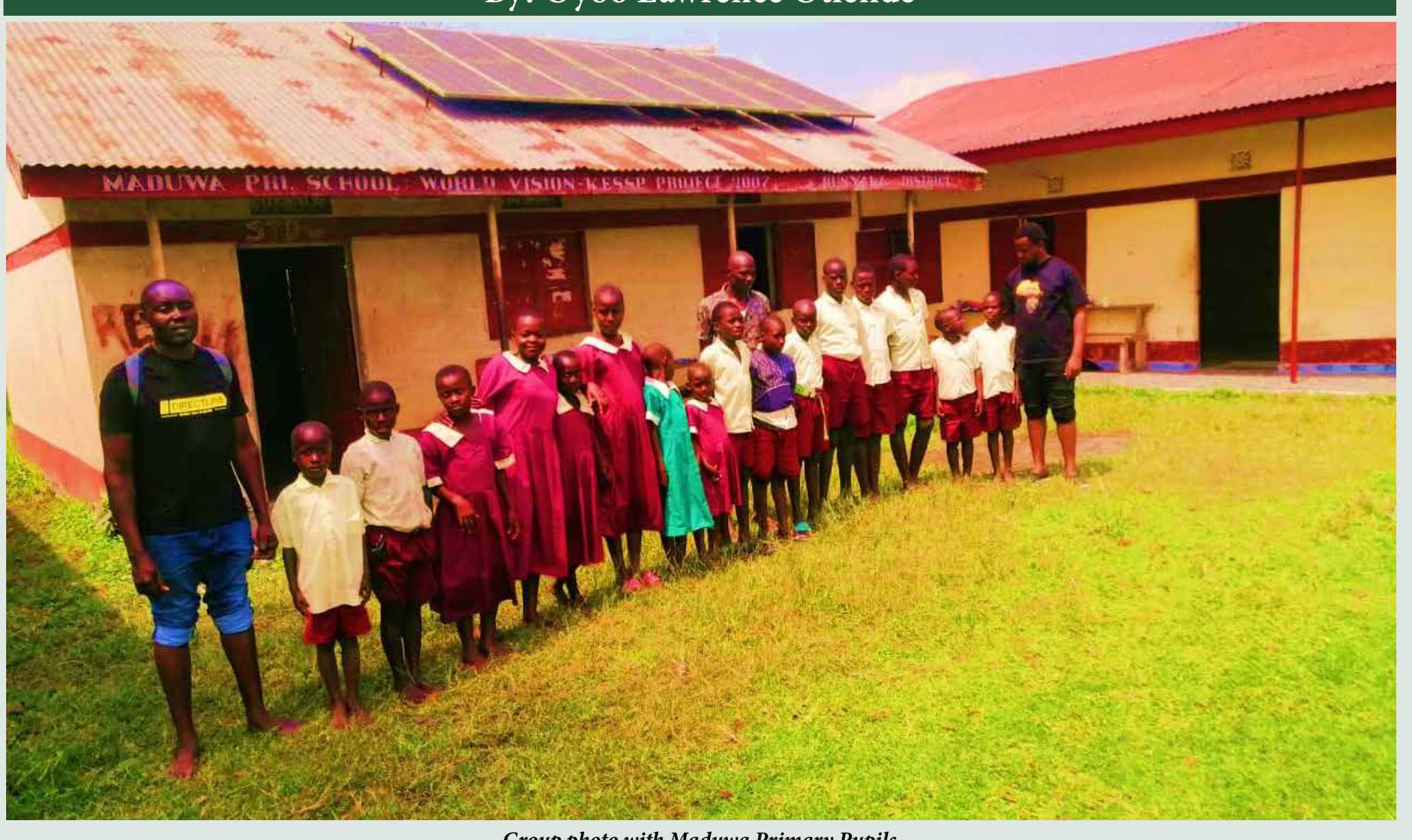
Group photo with Maduwa Primary Pupils

ave you ever asked yourself the amount of effort you put in to get knowledge? What milestones do you face or have you faced in your pursuit of quality education. I present to you a story of Maduwa Primary School where students must wade through deep waters to access education. Indeed, knowledge is power, and education is the key to success, but the quality of education can be hindered by some external factors such as infrastructure and location of institutions of learning. At Maduwa Primary School, the pupils, irrespective of age, have to