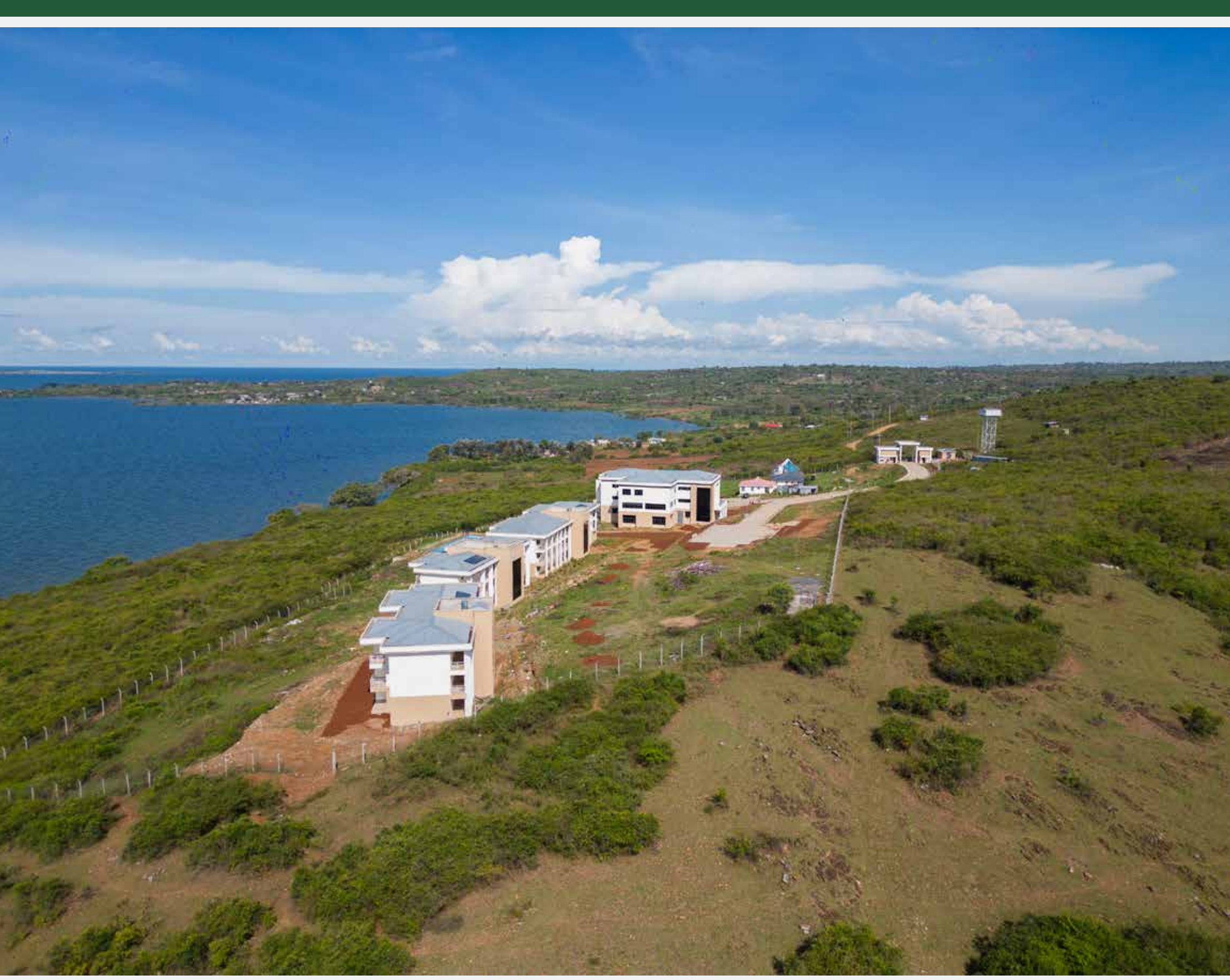
JOOUST Blue Economy Research Hub Miyandhe Campus