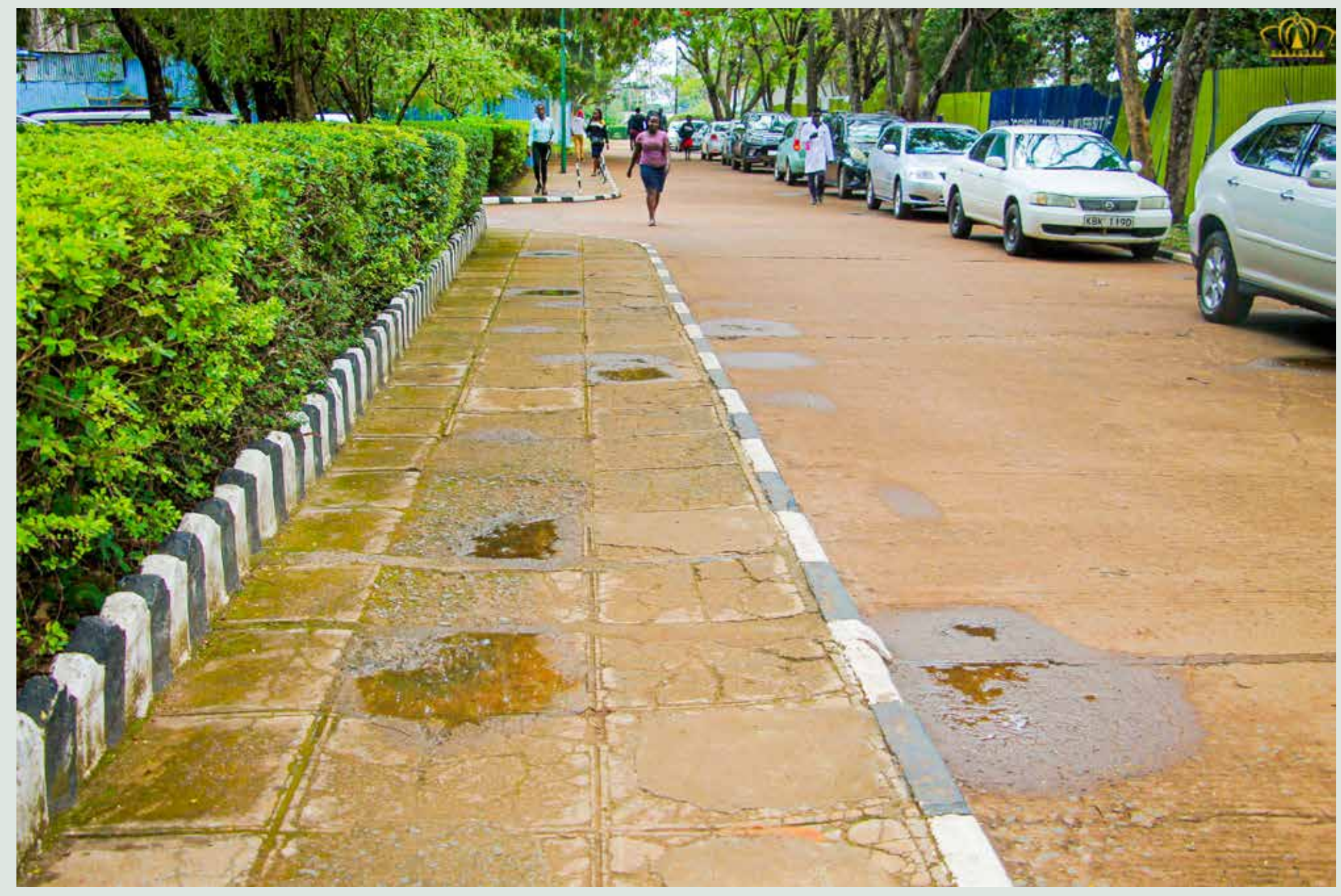
The most frequented pathway leading to the University Assembly Hall adjascent to the parking lot.

JOOUST continues to thrive, attracting generations of students who aspire to be part of this great legacy. As the sun rises everyday, JOOUST remains a beacon of knowledge, an incubator of dreams and a place where bright minds converge to shape a better future of themselves and the world at large.