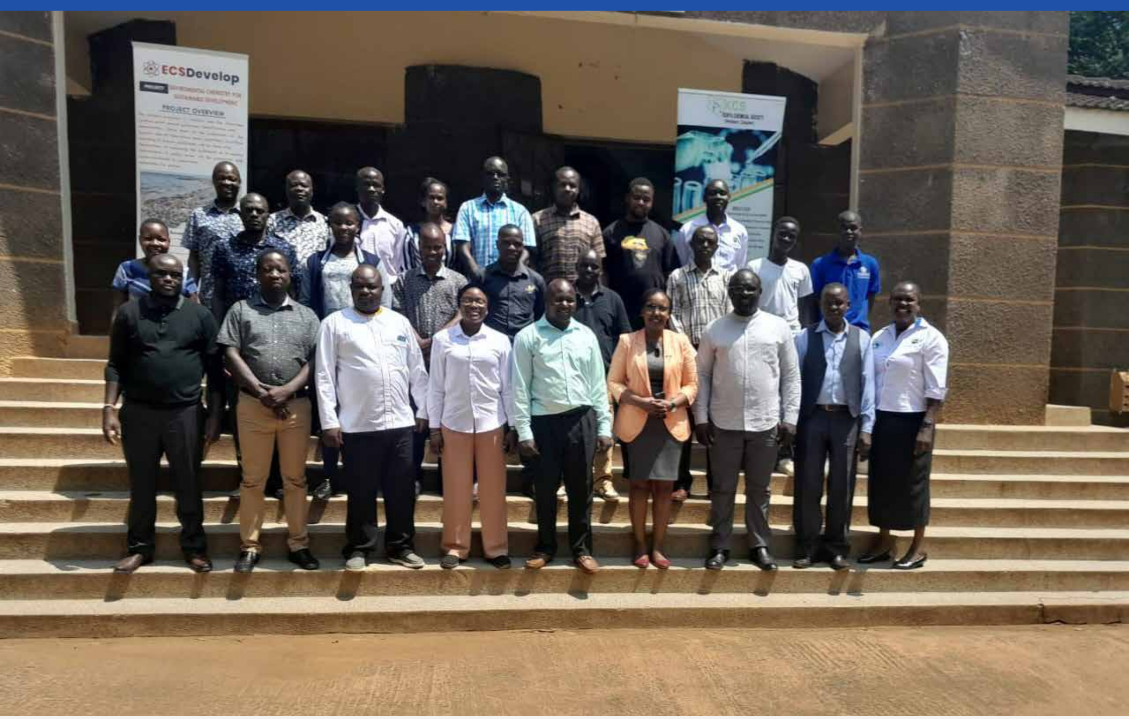
Participants and trainers pose for a group photo at the end of the training

A Publication from the Office of the Vice-Chancellor