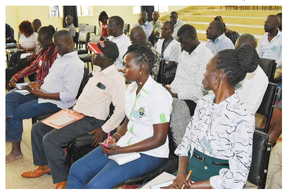
Trainees listening keenly during the session

management to international standards so as to produce competent personnel for the tourism sector.