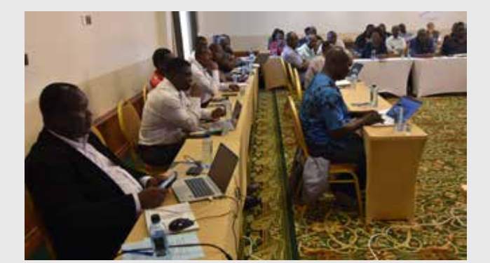
A section of the Deans, Directors and CODs listen to the proceedings