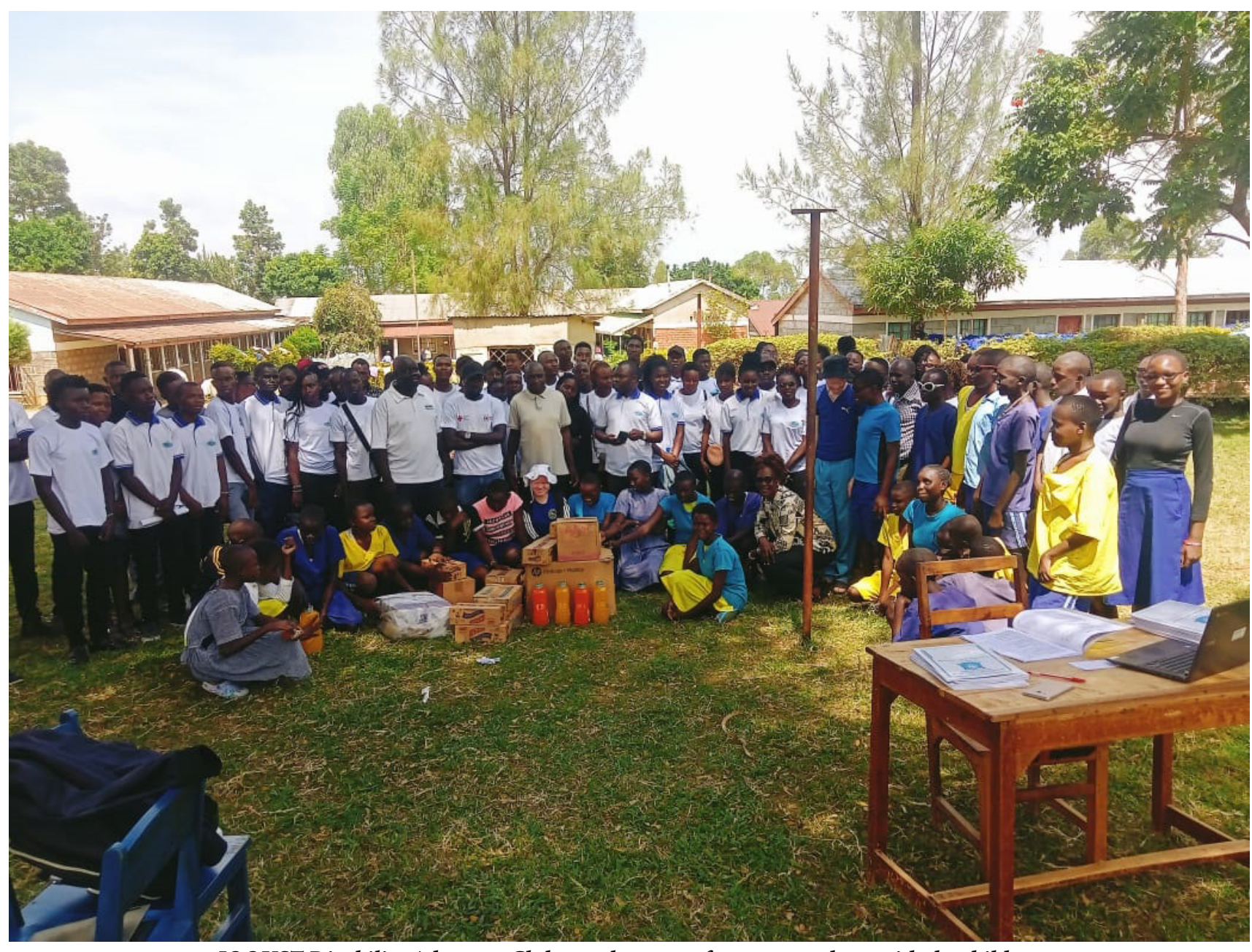
JOOUST Disability Advocacy Club members pose for a group photo with the children

┫ he JOOUST Disability Advocacy Club once again touched hearts with their recent visit to St. Oda Aluor School for the Visually Impaired on March 23<sup>rd</sup>, 2024, for an outreach program. Located in Gem Sub County, Siaya County, the school provides essential educational services for children and young adults aged three to twenty who are visually impaired, blind, or deaf/hard of hearing.