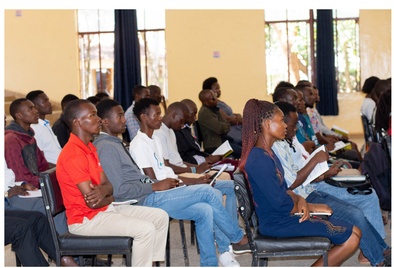
Participants keenly listen to various presentations during the seminar

Subsequently, the Board of Postgraduate Director,