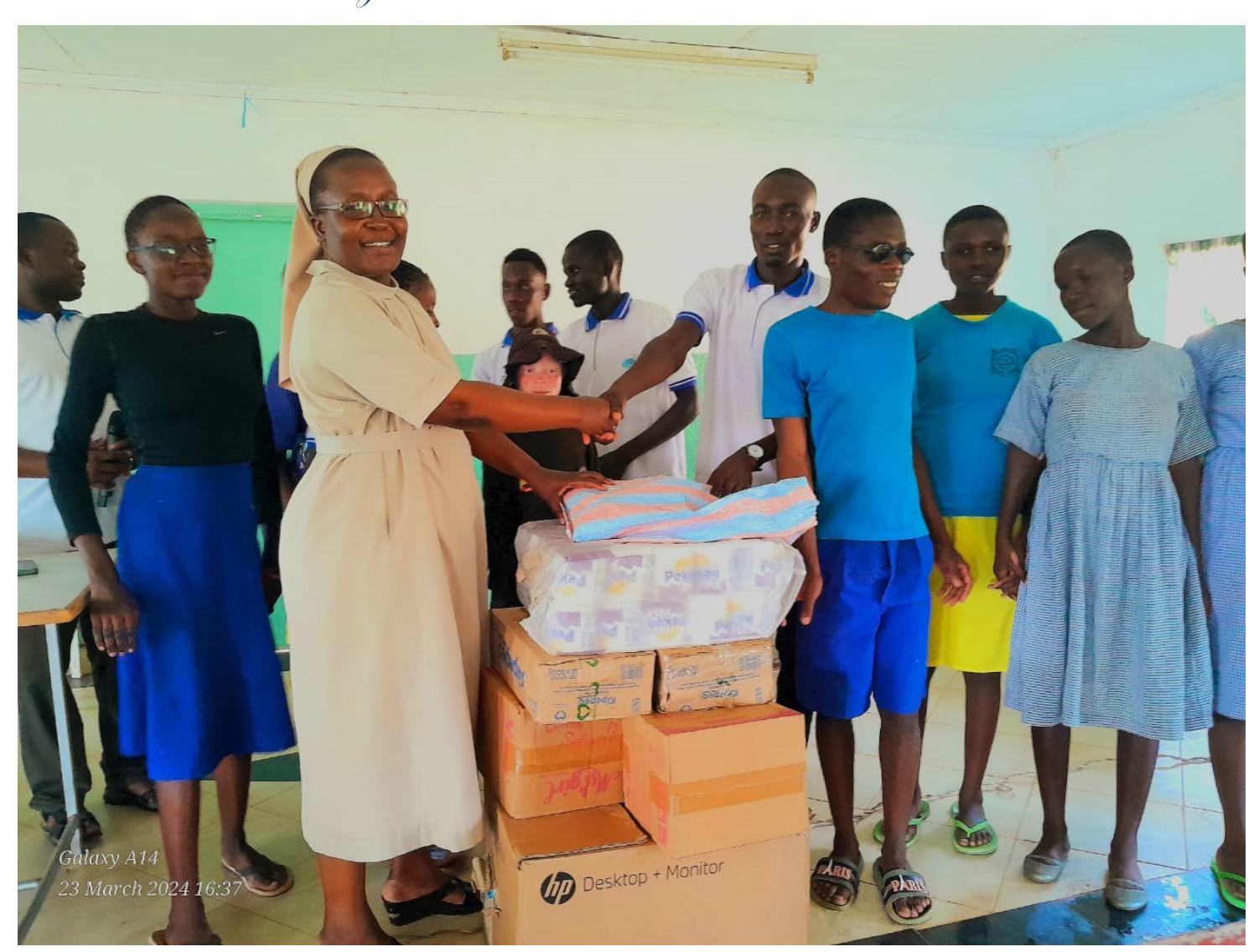
St. Oda Aluor School management receive donation from the club

disabilities and develop attitude positive towards People With Disabilities (PWDs), provide opportunities differently-abled for children to develop their talents through fun and sports days, work towards eliminating longstanding stereotypes based on the nature of disability within the community, engage in door-to-door visitations to promote awareness and understanding of disabilities and equip with members club knowledge and the experience to handle and understand individuals with hearing impairment through training.