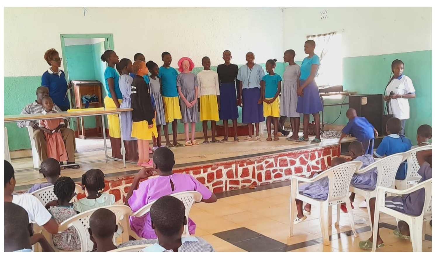
St. Oda Aluor School pupils making a presentation