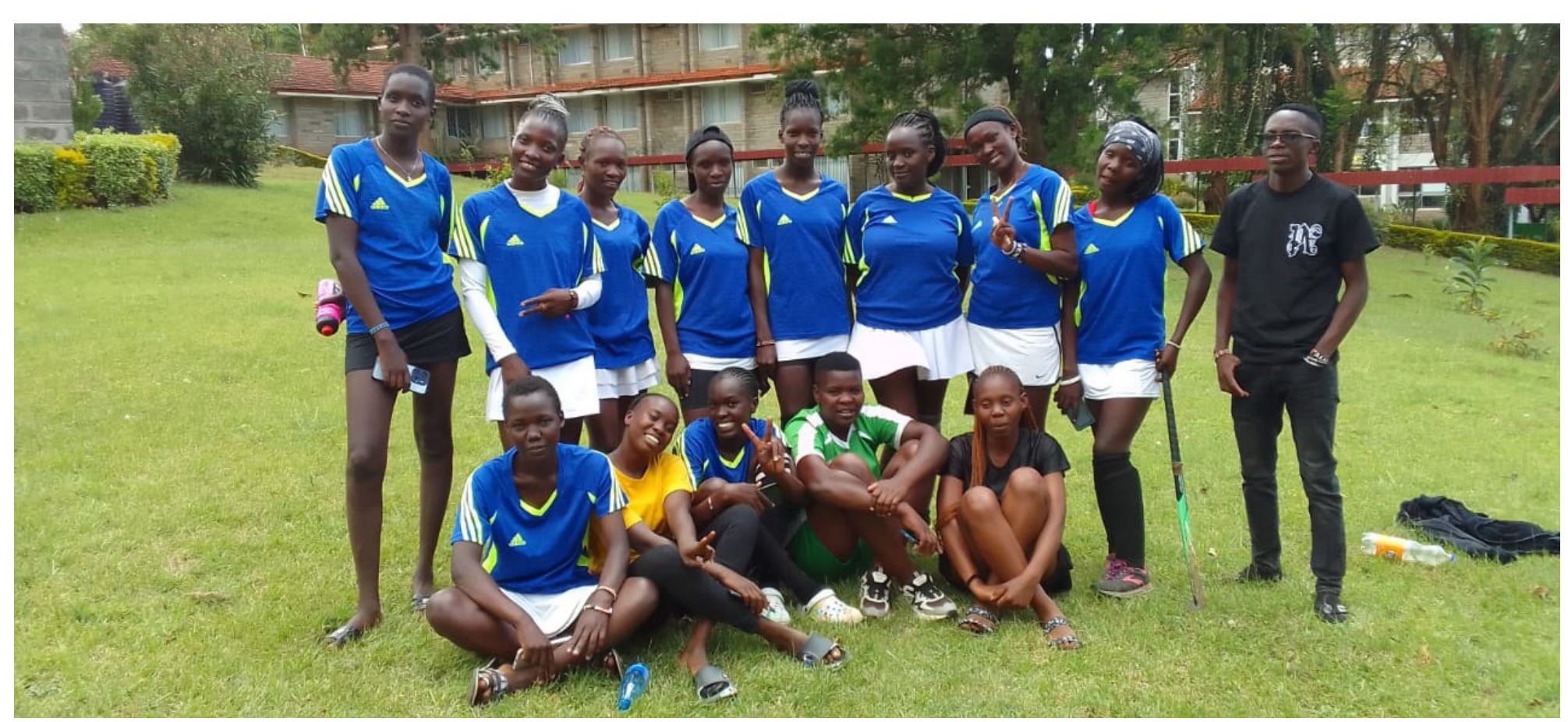
JOOUST hockey ladies team pose for a group photo